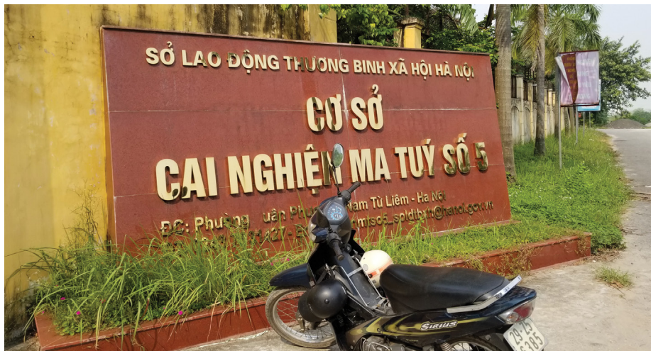
The Rehabilitation Center # 5 of Hanoi City

(e.g., UNAIDS and UNODC, WHO, the governments of Australia and France, and PEPFAR advisors). The plan envisioned community-based voluntary SUD treatment interventions, grounded in research evidence and integrated with relevant health and social support services. These services were to be delivered in part through the renovated network of compulsory rehabilitation centers and managed cooperatively by MOH and MOLISA.