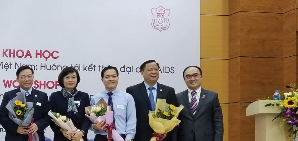
Conference Presenters: 25th Anniversary Meeting of HMU Center for Research and Training on HIV/AIDS (CREATA).

were PWID. Conversely, 34% of drug users were infected with HIV/AIDS. The response to control HIV and manage AIDS, described in earlier sections, was nothing short of dramatic, and it was successful. Drug treatment, combined with testing, anti-retroviral therapy, and now case finding, have essentially brought HIV/AIDS to a point where it is a preventable and manageable chronic health condition. SUD treatment, because it was designed to contain HIV/AIDS, exists primarily to address opiate use, in the context of clinics whose primary function is anti-retroviral therapy; it is managed by at least two distinct GVN agencies; and it remains separate from the compulsory rehabilitation centers that are used more frequently for people who use ATS. As it exists, the SUD-treatment resources are not designed to address the growing prevalence of ATS, which among young people has surpassed heroin use. Nor has it recognized addiction to alcohol (except in the mental health hospitals), which, as in most countries, is the substance on which there is most dependence and which in Vietnam has unaccounted-for social and economic costs. SUD treatment in Vietnam was not originally designed to address the health condition that is bio-psycho-social addiction to alcohol, opiates, hallucinogenic, amphetamine-type, or tobacco and related substances.