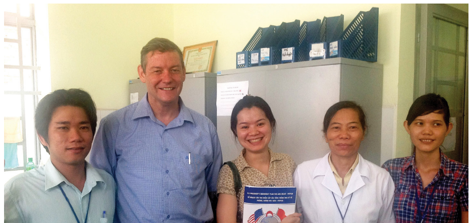
SAMHSA staff visited and provided technical assistance to a Methadone clinic