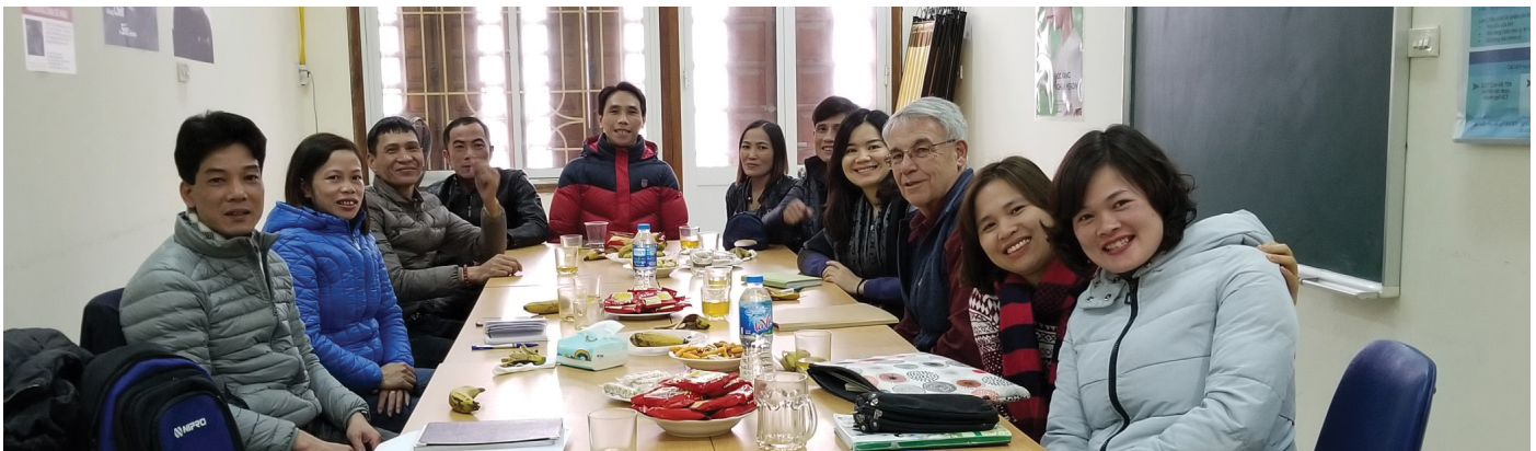
Peer recovery support members of the Lighthouse Group describe their experiences.

An incremental approach to reforming SUD treatment has occurred in many countries, including the United States. Steps toward developing an integrated, evidence-based, community-level SUD treatment system are followed by pauses that take the form of uneven implementation of sound policy or steps back that reinforce a perspective that drug addiction is a criminal behavior best addressed by sanctions. As noted by respondents, the scale-up of MMT to a point where it has reached more than 50,000 patients, the declaration that drug addiction is a disease , not a “social evil,” adoption of voluntary detoxification procedures, promulgation of the Renovation Plan (that integrates SUD treatment in a continuum of care delivered by local health center services), development of knowledge through Vietnam-based and-led research, and education of thousands of health-related staff in skills for evidence-based SUD treatment—these advances constitute progress that is remarkable in scope and significance. The impacts of these achievements are, however, diluted by the diffusion of responsibility for SUD among multiple governmental agencies, which sometimes results in conflicting approaches; by an approach that focuses on one drug of choice at a time, not addiction; and by resources that are less abundant and efficient than needed, as they are allocated across several agencies with variant approaches.